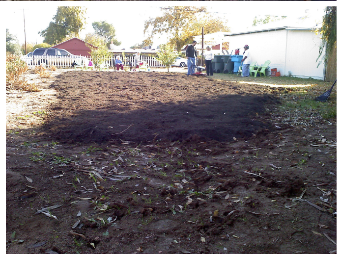
The area for the garden has been tilled and compost added. Later, it was covered with plastic.

2807 S. 27th Avenue Phoenix, AZ 85009 P. 602 269 5784 P. 800 500 3245 F. 602 269 3622 www.gro-well.com