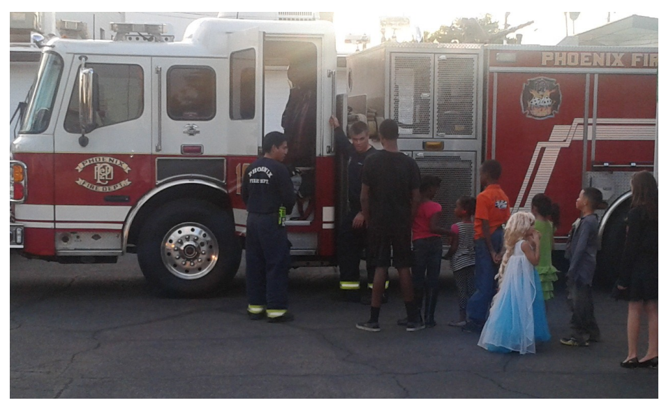
Thanks to the Phoenix Fire Department! Children at the GAIN event were allowed to talk to Phoenix firemen, go inside this fire truck, and wear a fireman's helmet.